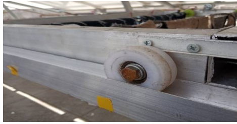
Fig1: Wheel Arrangement