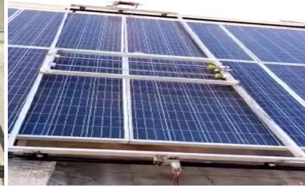
Fig 4: Solar Cleaning Model