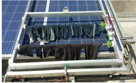
Fig 3: Cleaning Frame