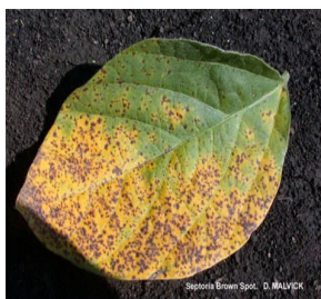
Fig. 2: Examples of Fungal Infection