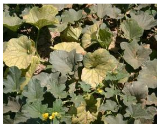
Fig. 3: Examples of Viral Infection

Others are Non-Infectious type diseases. Non-infectious diseases or disorders are caused by mineral toxicities, soil acidity, nutrient deficiencies, or environmental factors.