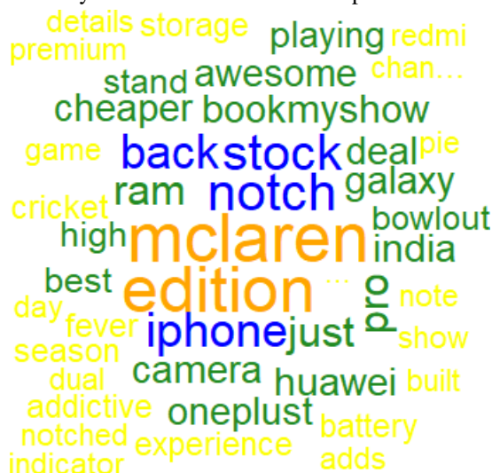
Fig. 2. WordCloud for Sentiment Analysis

The results of the test showed that though some of the customers were not that satisfied with the product but maximum people gave good reviews for the product and that's why our test concluded that the product was hit based on the sentiments of the people.