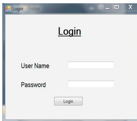
Figure 2: Existing User Login