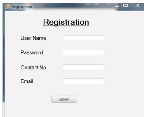
Figure 1: New User Registration

The proposed method is implemented in visual studio tool using C# language. There are different pages and modules for user registration, login, encryption, decryption and download files. If the user is new user, he must have to register first by filling his details like username, password, contact number, email id as shown in Figure 1. After successful registration he will be allowed to send the data for the implementation of the proposed method. The existing users just have to fill username and password to get login as shown in Figure 2. There are different options available to encrypt the file, download, zip file, steganography and sign out as shown in Figure 3.