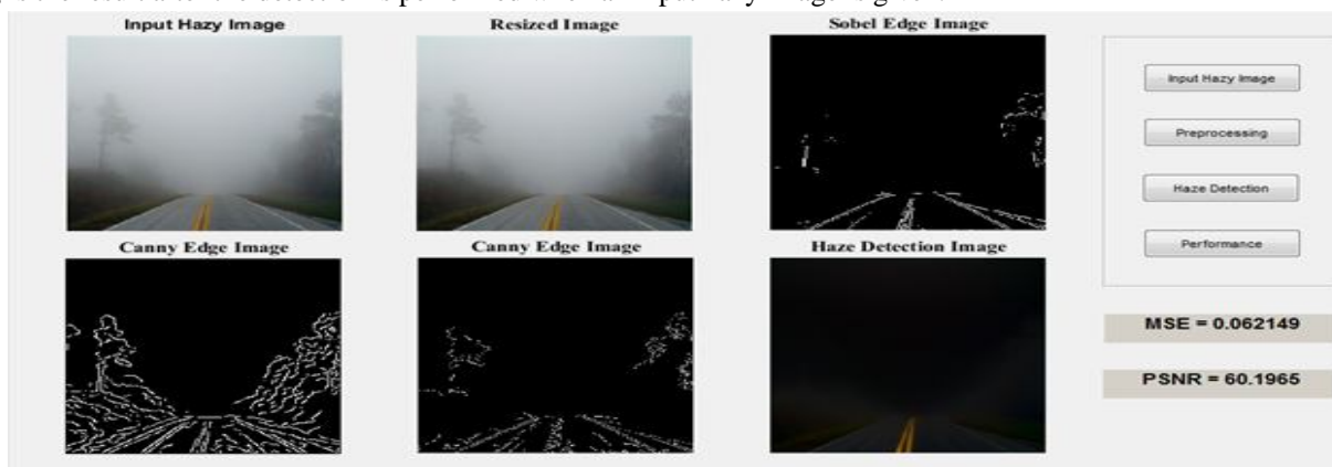
Fig. 1 Results

Following is the result after the detection is performed when an input hazy image is given.