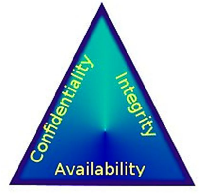
(Cherdantseva & Hilton, 2013).

In the above figure, the three aspects of the CIA triad model have been shown. They are interdependent on each other as shown in the form of the sides of the triangle. The triangle would be incomplete without even one of them; similarly the CIA triad would be incomplete without all the three elements. It is necessary that these three parameters namely, Confidentiality, Integrity and Availability are determined for the three-tiered web architecture structure and its suitability would be obtained from the developers. The questionnaire that was circulated among the participants was collected through surveys. 20 responses were obtained through the surveys. The population taken into consideration were the developers who have worked on three-tiered architecture. It has been statistically analysed by developing the important factors in the form of variables in the research. There is a huge emphasis on the development of three-tiered web architecture throughout the organisation. It facilitates the flow of information through the clients, retrieved from the database and accessed through the web application taken into consideration of the analysed through the web application taken into consideration of the factors taken into account through the responses obtained from the participants.