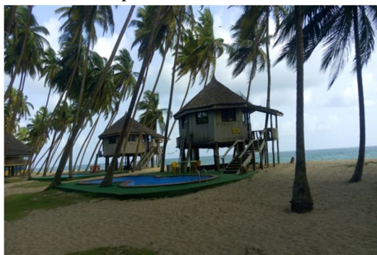
Plate 1: Showing charlet building and swimming pool of La Campagne

La Campagne Tropicana Beach Resort is a luxurious hotel and beach resort which mixes Nigeria traditional culture with modern ones; and thus offers a unique blend of natural environments which include a fresh water lake, accessible mangrove forest, a savannah, extensive sandy beach and the warm Atlantic sea; also the resort combine palm trees of differs strand mixes with soft and hard landscape for the landscape and aesthetic of the environment.