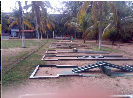
Plate 2: Showing Children playing ground