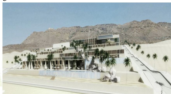
Plate 5. : Showing the Hotel View of Dead sea