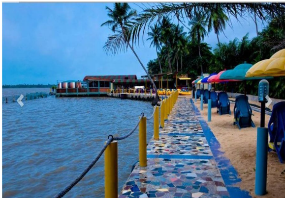
Plate 1: Showing beach relaxation arena of

The resort caters for series of activities and events such as Themed event, Concert, Trade Show, Honey moon, picnic, sporting activities etc. The landscape design of the environment is made up of organic architecture with the soft and hard landscape, the soft landscape include trees and ground covers while the hard landscape used are tiled flooring, interlocking paving and concrete paving.