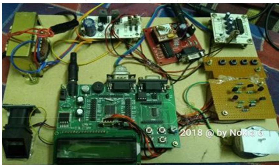
Figure 2: Hardware of Project

The complete hardware of the task is shown in the determine 2. The exclusive accessories of the task are clearly shown. That is project is inexpensive in fee and very reliable in case of better security. These BIOMETRIC headquartered lockers have many merits over the conventional locking systems which make it more fundamental. That is very convenient to use.