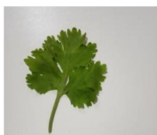
Figure 2: Original image

Herbal leaves identification is not a soothing task by eyes. But it was very multipart process because most of the leaves have analogous morphological features such as shape, color and texture. In this section, results are pondered about the observes. The database contains 360 real images. The resolutions of images were fixed to 89 X 142 pixels for the sake of workable computational speed. GLCM and K-means have been executed in MATLAB for real marine products images. Features such as color, shape, size and texture are extracted by GLCM and clusters of images are achieved by K-Means correspondingly. The image processing steps with an image is exposed in Figure 2, Figure 3, Figure 4 and Figure 5. The number of images are grouped by K-Means bestowing to its clusters is tabularized in Table 2. This method categorizes images into nine clusters in an efficient way and 83% of accuracy is reached as shown in Table 2.