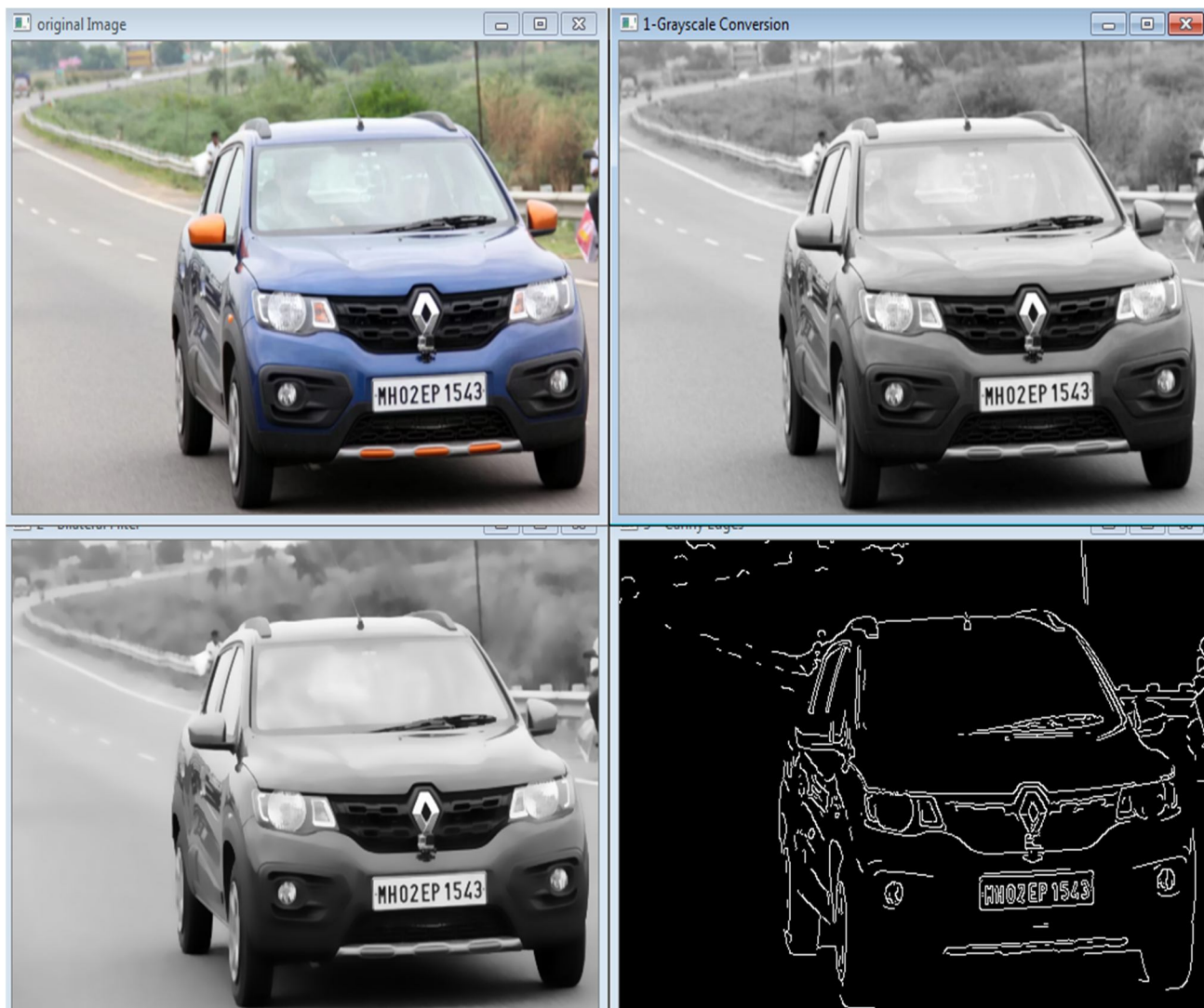
Figure 2: Automatic Number Plate Recognition system acquiring the number plate