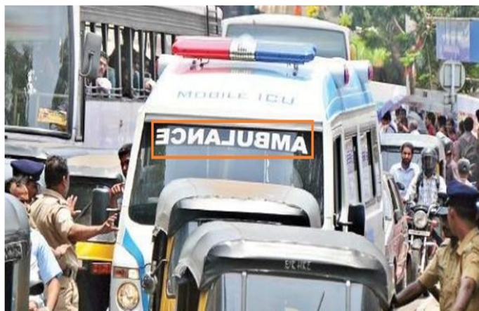
Figure 4: Emergency vehicle detected using Pytesseract

Figure 2, 3 shows the result of automatic number plate recognition (ANPR). i.e., how the number plate is extracted from the image. The first slide is the original image, the second one is the grayscale conversion of the original image. The third image is the result of the bilateral filter used to remove details, the fourth one is the output result of Canny edge detection. The fifth image overlaps the detected contours on the original image whereas the sixth image includes the only top thirty contours and the seventh image is that detecting the number-plate. The eighth image includes cropped number-plate which is gained by cropping the sixth image with the coordinates of the contour and then the pytesseract is used to obtain the number-plate.