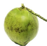
Figure 6: After removal of background