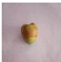
Figure 1: Immature coconut image

Totally 361 images are collected to verify the coconut freshness. These images are collected from Pillaitoppu village which is one of the famous place to grow coconut in Kanyakumari District, Tamil Nadu, India. This image dataset consists of three stage of coconuts. Coconuts take one year to fully ripen. The color of the coconut husk is good indication of ripeness. Immature coconuts are mostly filled with coconut water and bright green in color. The husk slowly turns into brown as known as fruits are mature. At peak maturity, when the coconut meat has hardened. The outer husk is solid brown throughout. Sample images of each stage is depicted in the Figure 1, 2 and 3. Also sample images in dataset is displayed in Figure 4. Next section describes the clustering by K-means in detail.