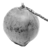
Figure 7: Gray image