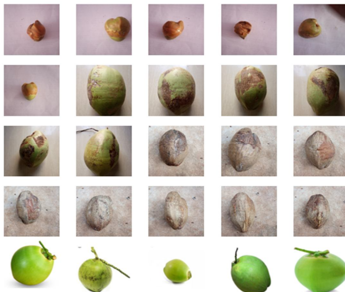
Figure 4: Sample dataset