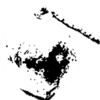
Figure 8: Segmented image

The color may be bright green with brown spots and total brown. K-means is the unsupervised learning algorithm also size and texture of coconut is different by their stage. K-means is applied to the features to group the coconut images. The above methods are repeated for all the images in the database. As a final point, K-means clustering is applied on images [4]. The steps in k-means are as follows: