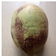
Figure 2: Mature coconut image