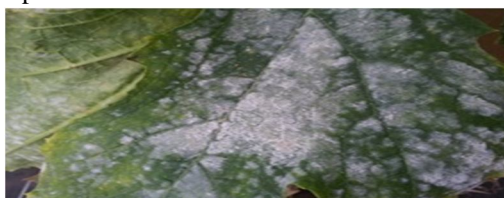
Fig 5. Powdery Mildew