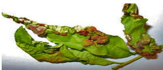
Figure 4. Leaf Curl