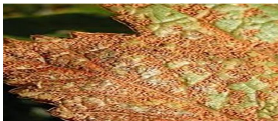
Fig 2. Rust Spores