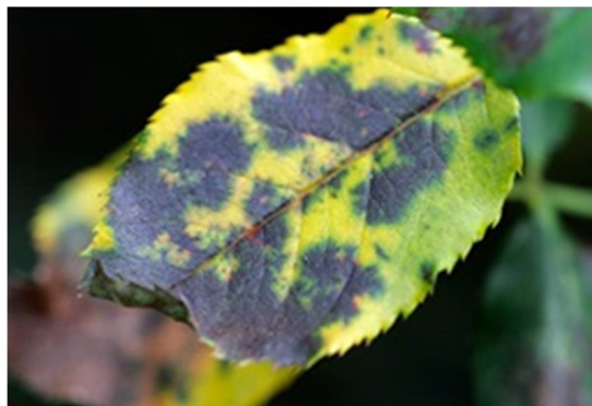
Fig 1. Black Spot