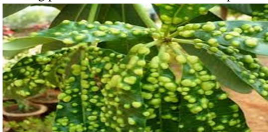
Figure 3. Leaf Gall