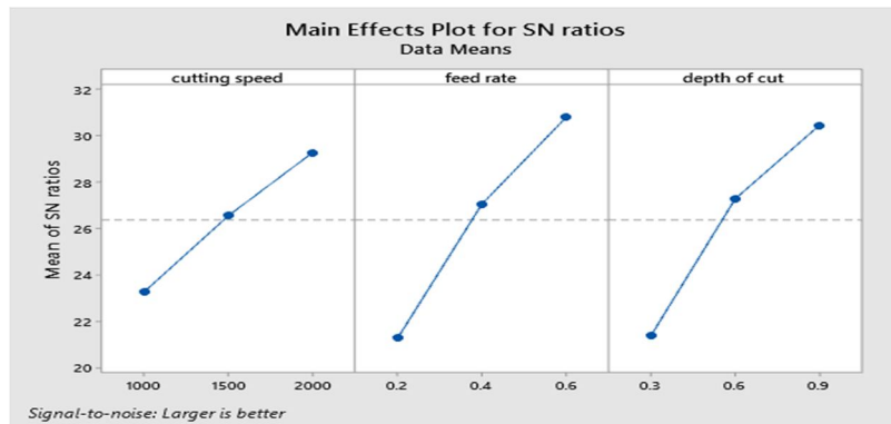
Figure 2: Effects of process parameter for MRR