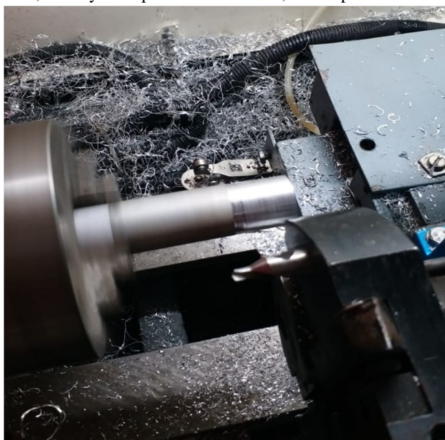
Figure 1: Aluminium Shaft during turning

In order to meet the growing demand to production complicated components of high accuracy in large amount of production, sophisticated machining parts and machinery have been established. The CNC machines often service the several mechatronics elements that have been developed over the years. To govern the machine tool G-code and M-code are used for perform any operation. Material is removed from the outer diameter of a rotation cylindrical work piece. To reduce the outer diameter of work piece the turning operation is performed, usually to a specified dimension, and to produce a smooth finish on the work piece.