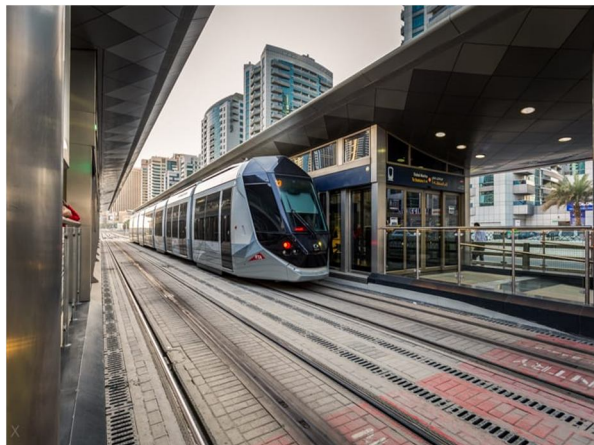
A Tram Station In Dubai

To cover the entire city, a charging infrastructure is to be created in order to fulfil the demands of people for travelling short distances as well as long distances. In the developed cities the availability of land for building this infrastructure is a serious problem. Therefore, a solution may be using an existing public network, in order to build this infrastructure. Such public network is depicted by tram station platforms, because of plenty number of platforms and the considerable area. Another advantage of these stations is that they are located in the centre of streets that eliminate the problem of photovoltaic panels (i.e. Shading). The charging infrastructure of tram stations has to be built modular in order to simplify its constructional work and maintenance.