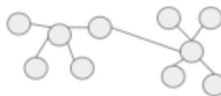
Fig. 3. Graph-based filtering (CF) .