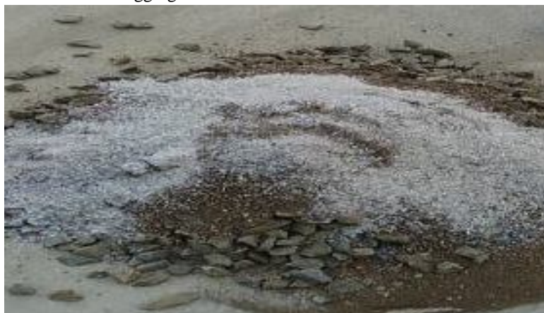
Fig. 1 Waste glass mixed in concrete

Glass powder has high silica content (70%), high surface area and amorphous character. These all such factors are shows glass powder will use as supplementary cementing material in concrete. Fortunately many studies have focused on the use of waste glasses as partial replacement of natural coarse aggregate in concrete and mortar.