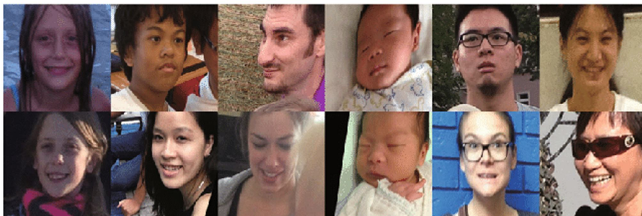
Fig.1 Faces from Adience benchmark for age and gender classification