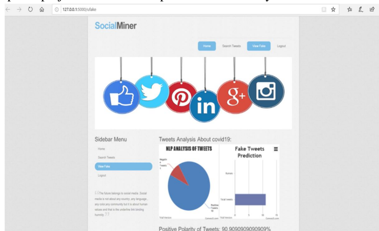
Fig.2:- Fake News Detection

In proposed system we have created one web based application using Python's Flask framework which is light weight. In proposed application we are fetching real time tweets from twitter data and applying algorithm on them to get result out of that. To access data from twitter, you need to have authenticated twitter developer account which allows you to access the data. After accessing the data we are also storing that data into SQL database. Then we applied algorithms on that data. For sentiment analysis, we are using Textblob and NLTK libraries. And for fake news detection, we have used TFIDF algorithm. It's taking approximately two to five minutes for execution. According to network complexity it fetches tweets from server and processes them accordingly. Following screenshot shows the final output of project which has interpreted COVID19 keyword on twitter and which is accurate and efficient.