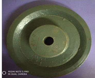
Fig No 6: Small Pulley

If a smaller pulley turns a larger one, the larger one will turn slower, but with more power available at the shaft. If a bigger pulley turns a smaller one, the smaller one will turn much faster than the bigger one but with less power available at the shaft. How does pulley size affect speed? By changing the diameter of the pulley wheels, speed can be changed. A smaller pulley turning a larger pulley results in the larger one moving more slowly but with more shaft power.