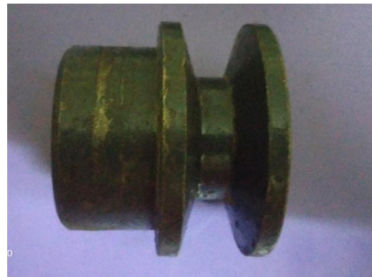
Fig No 7: Idler pulley

Idler pulleys are used to take up slack, change the direction of transmission, or provide clutching action. Idler pulleys are rollers that do not produce any mechanical advantage, nor transmit power to a shaft. Idler pulleys are used to lead a chain around a bend or to take up slack in a drive chain.