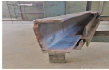
Figure no 3-C-Channel

The structural channel, also known as a C-channel or Parallel Flange Channel (PFC), is a type of (usually structural steel), used primarily in building construction and civil engineering. Its cross section consists of a wide "web", usually but not always oriented vertically, and two "flanges" at the top and bottom of the web, only sticking out on one side of the web. It is distinguished from I-beam or H-beam or W-beam type steel cross sections in that those have flanges on both sides of the web.