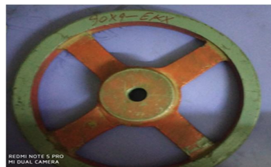
Fig No 5: Large pulley