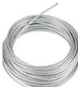
Fig No 8: Wire rope

Wire rope is several strands of metal wire twisted into a helix forming a composite "rope", in a pattern known as "laid rope". Larger diameter wire rope consists of multiple strands of such laid rope in a pattern known as "cable laid".