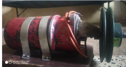
Figure no 9- Starter motor

Automobile self starter also known as starter motor or simply starter is an electric motor initiates rotational motion in an internal combustion engine before it can power itself.. One of the important feature of these electric motors is a soft on/off electronic switch for easy operation. Automobile self starter or starter motor are known for flawless performance and high durability. These parts find application in trucks, tractors, cars, bikes and ATV of all models and makes. These starter motors are equipped with various high quality components made by renowned companies. These motors are highly dependable and economically priced. These are motors are capable to suit various application