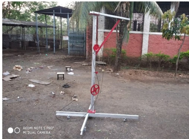
Figure no 10-Actual model