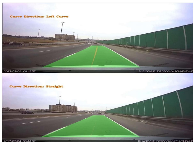
Fig2 Curve Direction

According to the method of section VI.B, the recognition results of the lane- line bending direction as shown in Fig. 15. The green line in the image is the preliminary lane-line reconstruction result, the red line is the extension line of the straight line in the near view region, and the red text on the left side of the image represents the bending result.