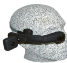
Optic see-through system (Inition,2011)