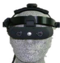
Video see-through systems (Trivisio,2011)

The head-mounted device is a sort of display put on the head or as a feature of a helmet. It has a little display optic before one or each of the eyes.