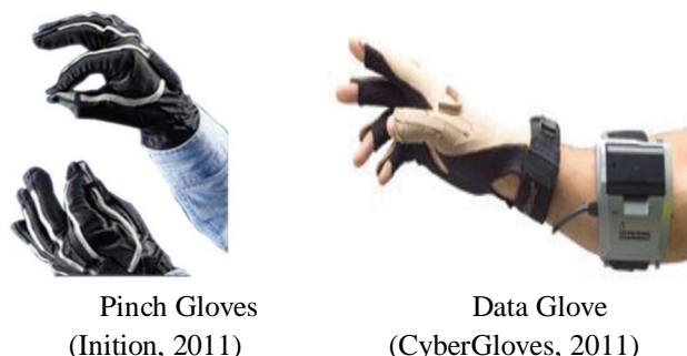
Fig 4: Pinch Gloves

A pinching gesture using a pinch glove can be utilized to grab a virtual item and provides a dependable and low-cost method of recognizing physical gestures.