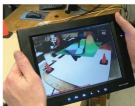
A handheld AR system displaying a three dimensional graph registered to the cones and table. (CSM, 2011)

Miniature computing devices that have a display that the client can grasp in their hands.