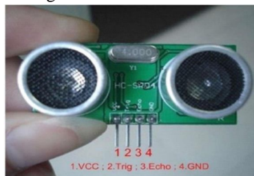
Ultrasonic Distance Sensor