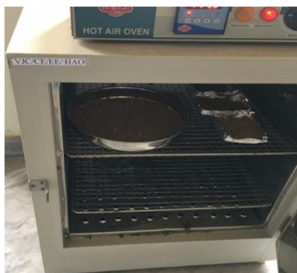
Fig -2: Oven drying

The peels were collected and cut into small pieces. The collected peels were washed to remove the dirt and impurities. The peels were oven dried at 100°C for 24hrs. The peels were powdered and washed several times with distilled water to remove coloring matters. Again the peels were oven dried at 100°C for 5hrs. The powder which passes through 300 \mu m and retained on 150 \mu m were collected.