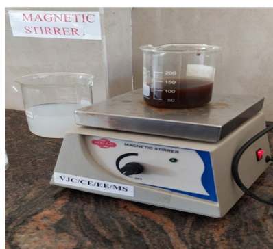
Fig -4: Magnetic stirrer

The percentage removal of COD from the synthetic wastewater was calculated.