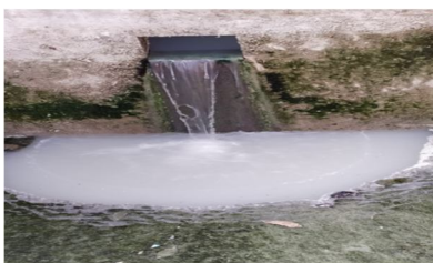
Fig -1: Wastewater collection tank

The wastewater was collected from Jeeva Milk Plant, Kothamangalam, Kerala. The characteristics of dairy wastewater was studied and shown in Table 1.