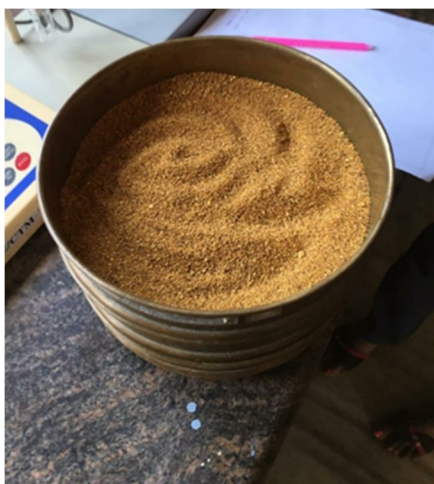
Fig- 3: Sieving the dried peels