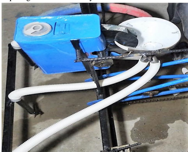
Figure. Seed sowing