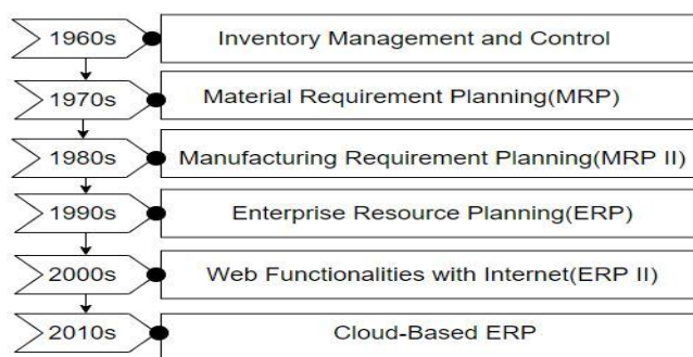
Fig. 1 History of ERP