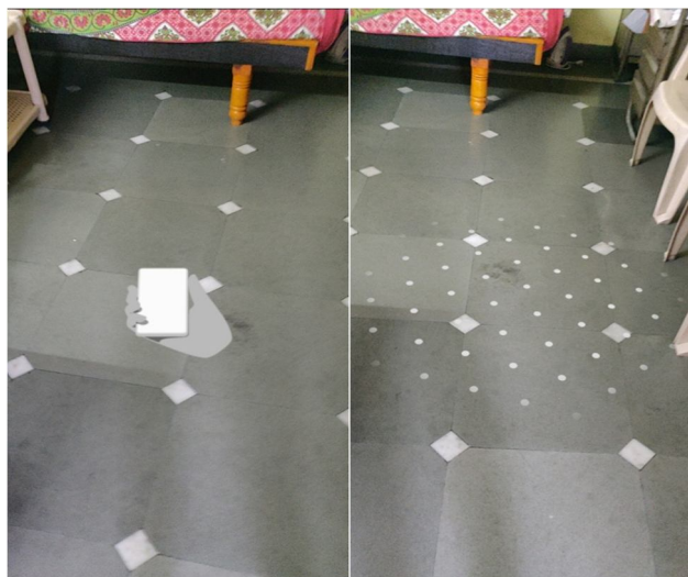
Fig. 2 User gesture guide

Presently, we demonstrate support for client task like moving, scaling and rotating so we make a hub of type TransformableNode. The TransformableNode is answerable for moving, scaling and turning hubs, in view of client signals. Once made you have to connect it with Renderable hub. At last, you have to interface the TransformableNode to the AnchorNode, in a child parent relationship which guarantees the TransformableNode and Renderable stay fixed set up inside the expanded scene. Now you can run application and place objects in real time.