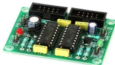
Fig:L293D driver module

3) L293D driver Module : This driver module gives the power supply to the robot and hence it used to move the robot. It takes the instructions from the microcontroller and according to the instructions the robot moves from one direction to another.