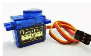
Fig: Servo motor

Servo motor is used to rotate the water tank 180 degrees. When the robot reaches the fire and stops then this servo motor activates and rotates the water tank.