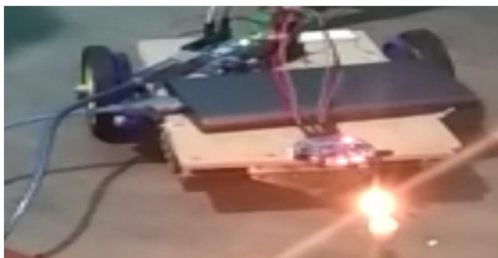
Fig: working module

It automatically extinguishes the fire without using any man power. So, we cannot risk any policemen lives in fire accidents. And there are some places where we cannot send fire engines and unable to use fire extinguishers and there these robots play a major role to stop the fire.