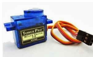
Fig: Servo motor

Servo motor is used to rotate the water tank 180 degrees. When the robot reaches the fire and stops then this servo motor activates and rotates the water tank.