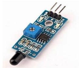
Fig: Flame Sensor

2) Flame Sensor : Flame sensor is used to detect the fire in its surroundings and send the input to the Arduino board. Whenever there is an increase in its temperature happens it sense the temperature and gives this information to the Arduino board. It is the major component used in our project.