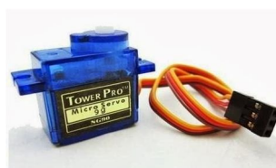
Fig: Servo motor

Servo motor is used to rotate the water tank 180 degrees. When the robot reaches the fire and stops then this servo motor activates and rotates the water tank.