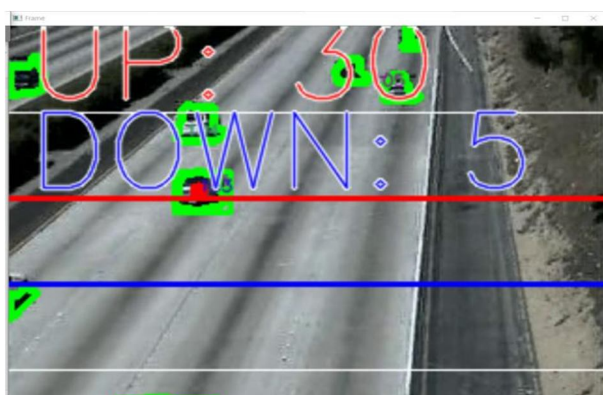
Fig. 2 Vehicle Contours

This module consists of two major steps, image enhancement and foreground extraction/learning. Foreground objects are made visible by using the background subtraction technique. This is carried out by setting the steady pixels of steady objects to binary 0. Once after the background subtraction is done, in order to obtain the contours of foreground objects, image amplification techniques like noise filtering, morphological dilation, etc are used. The result obtained from this the foreground.