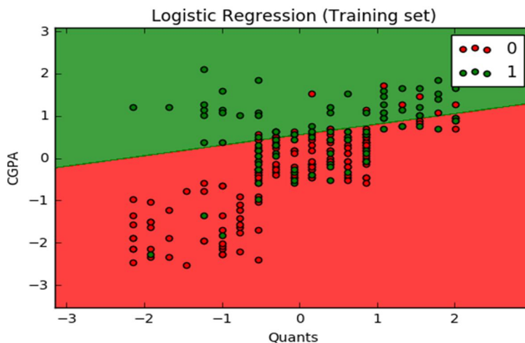
Fig 1 Graph for Training set

Logistic Regression is a one the Machine Learning algorithm which is used for the problems classification, it is a predictive analysis algorithm and based on the concept of probability. For predicting a value based on history of data, it is necessary to train the prediction model. In our case, we choose logistic model as a predictor system so we shall be training logistic model using dataset collected by the institution.Through Logistic Regression algorithm we are able to predict the probability of the students getting placed or not and display the result in terms of percentage .The data collected by the college is divided into training and testing dataset which is given to the model for training. This algorithm trains the model to predict the probability of the student getting placed by the training dataset provided.