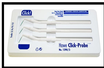
Fig 1: The TPS Probe Or The Hawe Click Probe