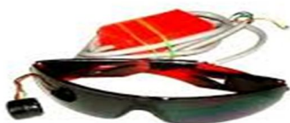
Figure 1.Set up of Eye Blink Sensor.

This LCD area is utilized to outline the status of the occasion. The Liquid Crystal Display (LCD) is utilized to show or brief for fundamental data.