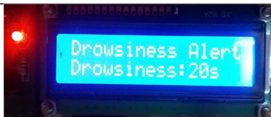
Figure 3.LCD Display of alertness.