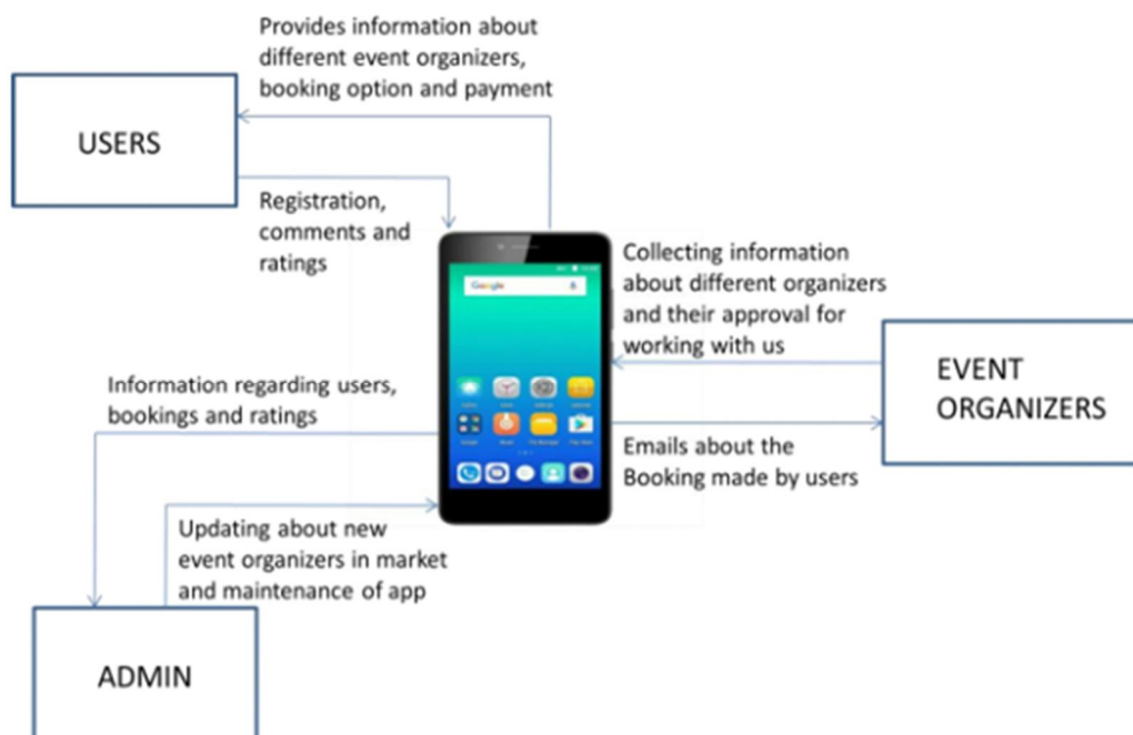
Figure 2: Architecture Design of Event Organization System