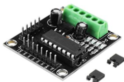
Figure 2. Motor driver