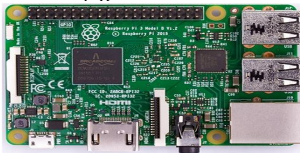
Figure 1. Raspberry pi