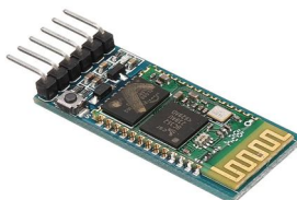
Figure 4. Bluetooth