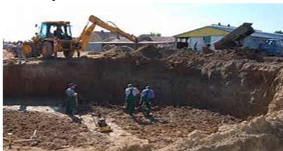
Fig: Excavation Hazard