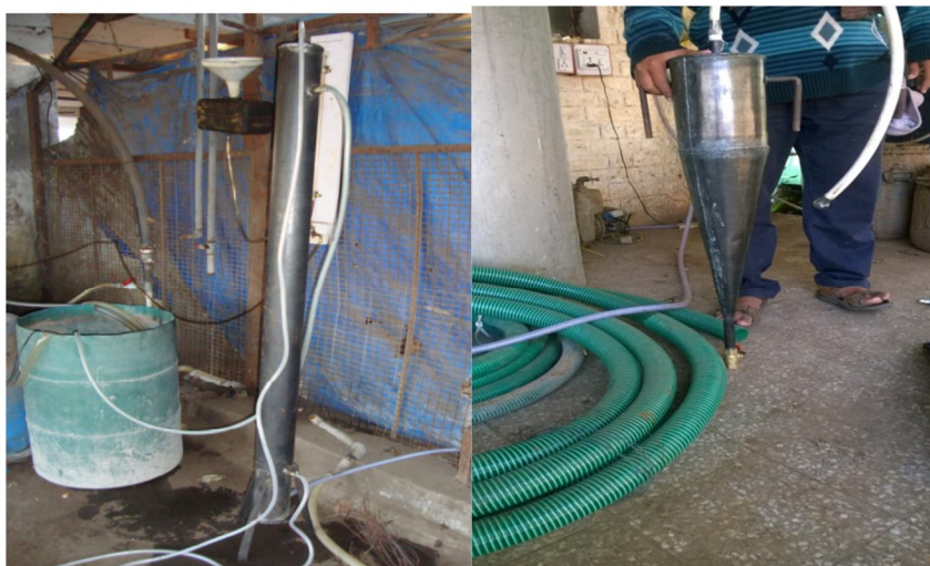
Fig 1 Water Scrubbing Unit Fig 2 Cyclone Scrubbing Unit