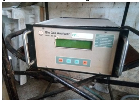
Fig 4 Methane Analyzer

Methane analyzer is a device which indicates the percentage of methane which is scrubbed from the biogas. The methane analyzer is as shown in the figure below. This device is required in any of the scrubbing technique as it helps us in indicating the rich methane percentage. The arrangement of Methane analyzer is as shown in the figure 4.