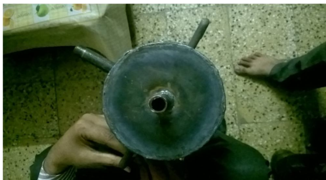
Fig 3 Top View of Cyclone Scrubbing Unit

Methane analyzer is a device which indicates the percentage of methane which is scrubbed from the biogas. The methane analyzer is as shown in the figure below. This device is required in any of the scrubbing technique as it helps us in indicating the rich methane percentage. The arrangement of Methane analyzer is as shown in the figure 4.