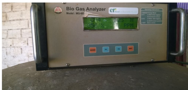
Fig 7 Observation after single stage scrubbing

The observations obtained by the two setups are as shown below: