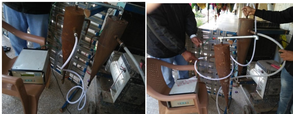
Fig 6 Two setups in series connections.

The results obtained after the single stage scrubbing indicated the reading of 36% scrubbed methane. Further for obtaining the better results the scrubbing of methane was carried out in the series connection of two cyclone type scrubbers. Both the cyclone type scrubbers were connected in the series as shown in the figure 6.