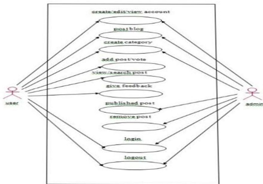
FIG 1: Authorities given for user and administration.