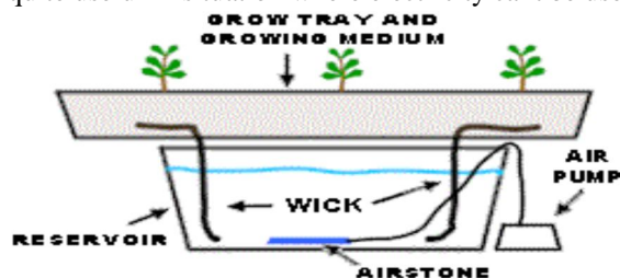
Figure: 2. Wick System

The wick system is the simplest of all six types of hydroponic systems. That's because classically it doesn't have any moving parts, thus it doesn't require any pumps or electricity. However some people still like use an optional air pump in the reservoir. Because it doesn't need electricity to work, it's also quite useful in situation where electricity can't be used, or is unreliable.