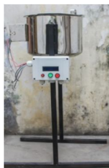
Fig 1: Image of Smart Storage Bin