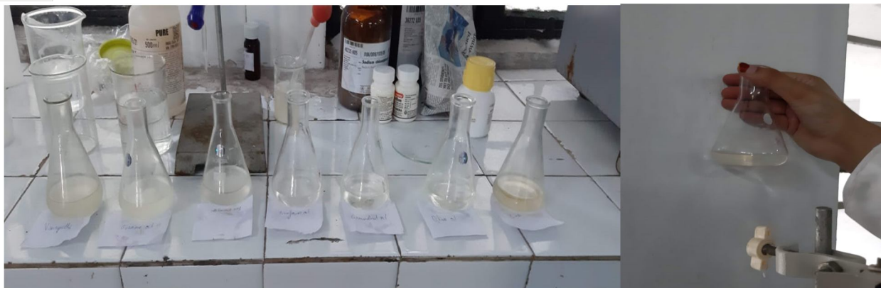
Yellow colour disappeared after titration

For acid value; olive oil, sesame oil and ghee had more acidic content than required. As mentioned above, acid value is relative to rancidity.