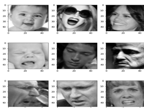
Figure II Example of images from ICML 2013 facial expression dataset

In this paper, I have used the ICML 2013 Facial Expression Recognition Challenge dataset. This dataset consists of 48x48 pixel gray-scale images of faces. In our dataset, 80% of the dataset was selected for training purpose and the remaining 20% was chosen for testing. Our training set contains 28,708 images and our test set contains 7178 images of 7 facial expressions (happy, sad, surprised, angry, disgust, afraid, and neutral). This dataset was prepared by Pierre-Luc Carrier and Aaron Courville, as part of their ongoing research project.