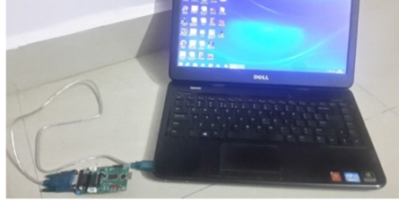
Figure 3: Snapshots of the Real time Hardware with appliances connected.

The system further store data about PV panels system, and Scheduling of household equipment's. Such a system will complete the task by periodically calling the monitoring device, collecting the data and storing them in a database. This database can then be sorted in order to produce graphs and other output representing such things as charge curves, solar insolation data, average power output over time, and so on. A manually created graph constructed from data taken during a week-long test of this system with a functional solar power system.