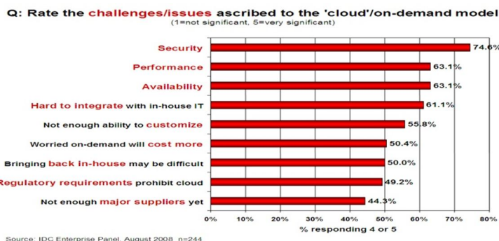
Fig.2 Performance evaluation by IDC

Cloud Security with all its flexibility and dynamic nature have one big concern and that is security. Though cloud is reaching to every field quite rapidly it is still in its early adoption phase. The services provided by cloud needs to be more Dependable, Secure and Relevant. A survey done by IDC took nine challenges fig.2 commonly used to evaluate the performance of cloud services and cloud infrastructure. And in that survey security turns up as the major concern. As the information regarding businesses, bank, IT information are very critical in nature customers and end user worry about their vulnerability to attack.