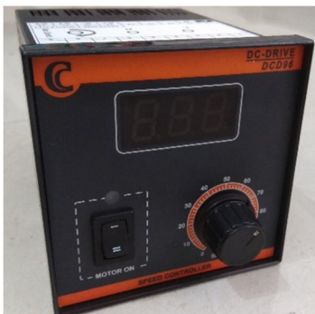
Fig.8.PMDC motor controller Digital type