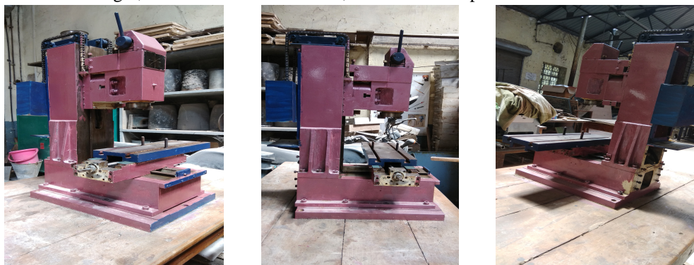
Fig. 2 structure of CNC machine

The machine structure is the vital part of the machining tool. It merges all machine components into a single complete system. The machine structure is vital to the efficiency of the machine since it's directly affecting the total dynamic stiffness and also affecting the damping response. Perfectly designed structure can afford high stiffness, which leads to precise operation. Mini scaled machine tool required more precise stiffness than the regular large-scale machine tool as shown in Fig. 2. The next level will be deciding the criteria required which is firstly the length travel. The length travel is the length of the X, Y and Z axis that travels from one point to another. The X axis move left & right, Y axis move front & back, Z axis moves Up and Down.