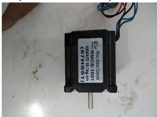
Fig. 4. Stepper motor NEMA 23 10.1 kg.cm RMCS-1001

2) Stepper Motor: Stepper motor & Accessories: It’s a combination of stepper motor drive connected with pillow bearing with lead screw that is mechanical linear bar and linear bearings that drives rotational motion into liner motion with minimum friction. The stepper motor as represented in Fig. 2 the speed is directly proportional to the pulse frequency where it stands of the higher the output voltage from the easy driver the more level of torque drive.