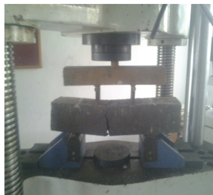
Fig 4.2.Prisims Testing