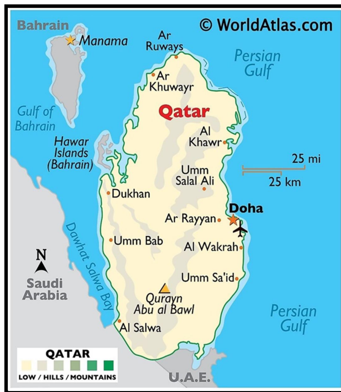
Figure 1: Location of the county of Qatar taken cc: Google Images