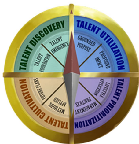
Figure 3: Simulacrum The Lived Experiences of Multifaceted Professionals from Talent Discovery to Cultivation

This study utilizes the phenomenological approach to describe the lived experiences of multifaceted professionals relative to the central question: "How do multifaceted professionals cultivate their talents despite having their profession and possessing two or more innate abilities?" The researchers sought to explore how professionals further advance their talents while concurrently balancing their work-life. Talent advancement alongside career growth signifies a positive approach to maximizing their abilities and serves as preparation for optimum talent performance (Yuen et al., 2010). Figure 3 shows the simulacrum focused on four major themes: talent discovery, talent utilization, talent prioritization, and talent cultivation. These constitute their whole talent evolution process starting from the identification up to the unfoldment. Moreover, this study also delves deeper into each stage's intricacy to better understand the methods and factors.