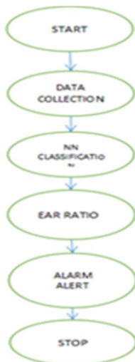
Flow chart of driver drowsiness

The various angles and highlights gave by the framework to distinguish languor just as different highlights to give interruption location are clarified in detail. The flowchart of the languor location framework. As referenced, the procedure starts with social affair floods of information by gathering picture outlines from the video gushing by means of the camera module. The gathered pictures are utilized for handling, and the sleepiness is recognized. When the languor is distinguished, the individual driving a vehicle is cautioned in the vehicle through the speakers in the vehicle.