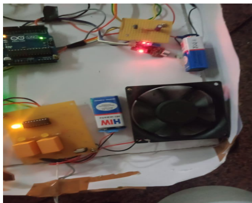
Figure 3. Exhausted Fan

The industries that are having high gas level inside then ,exhausted fan will be switch on .The notification will be send to the mail and the application users.