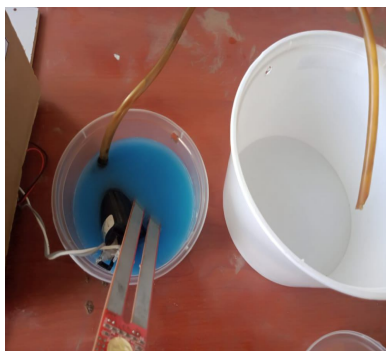
Figure 2. PH level is abnormal

The industries that are having high gas level inside then ,exhausted fan will be switch on .The notification will be send to the mail and the application users.