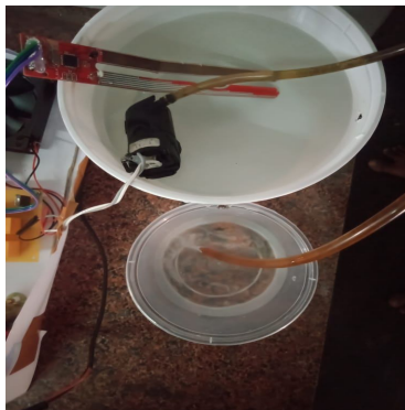
Figure 1. PH level is normal

In chemical industries, the dye water is released into the river. If the ph level of water is above in base level then the valve will be locked. If the ph level of water is below in acidic level then the valve will be unlocked.