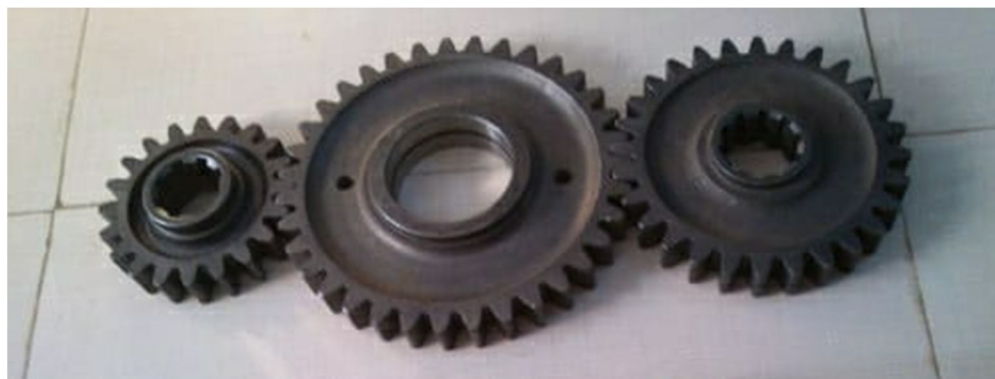
Fig Gear sets