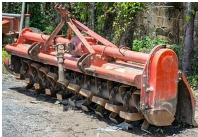
Fig Rotary Tiller Machine

Since Material M10 Carburized Steels (20MnCr5) has minimum total information content, it is thus selected as best alternative.