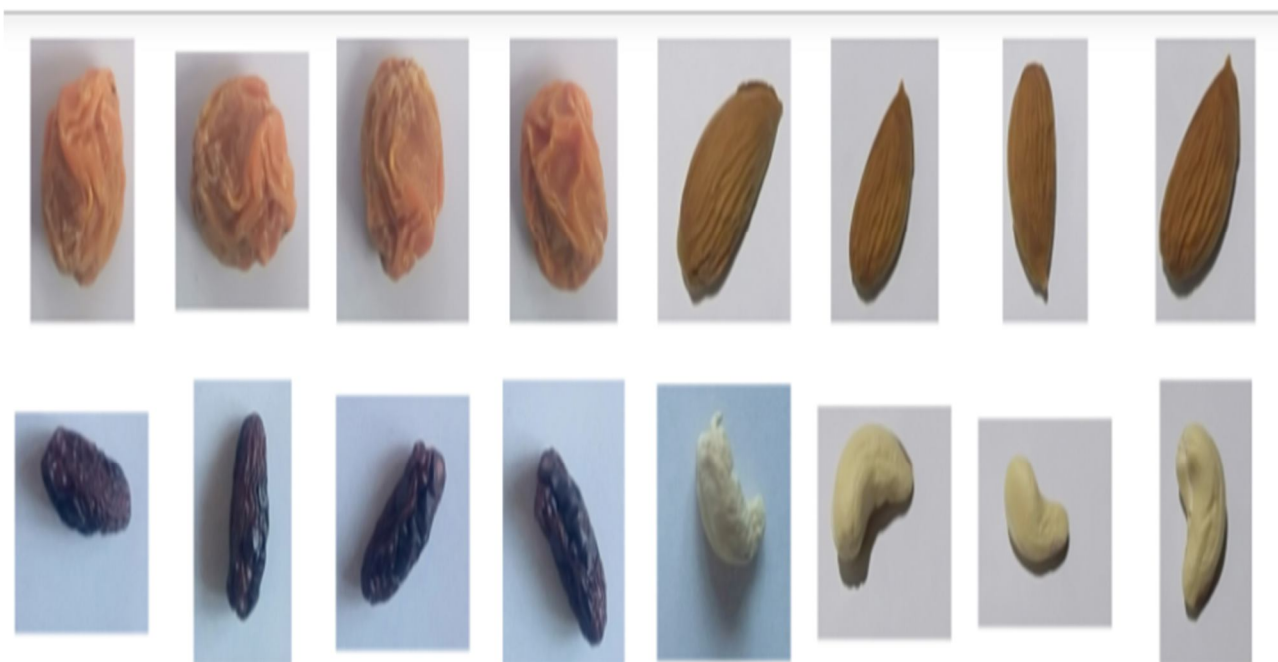
Fig. 1: Sample of Dry Fruit Dataset

The four classes of Dry fruits comprised of Apricot , Almond , Cashew , and Date each having 200 images. The overall collected dataset was divided into two sets in the ratio 85:15 into Train Image Set and Test Image Set images respectively. The overall methodology for the proposed work is presented in figure 2.