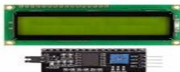
Fig 4. 16x2 LCD with HD44780 IC

LCD modules are very commonly used in most embedded projects, the reason being its cheap price, availability and programmer friendly. Its operating voltage is 4.7V to 5.3V. Further, the LCD should also be instructed about the position of the pixels. Hence it will be a hectic task to handle everything with the help of MCU, hence an Interface IC like HD44780 is used, which is mounted on the backside of the LCD Module itself. The function of this IC is to get the commands and data from the MCU and process them to display meaningful information onto our LCD Screen.