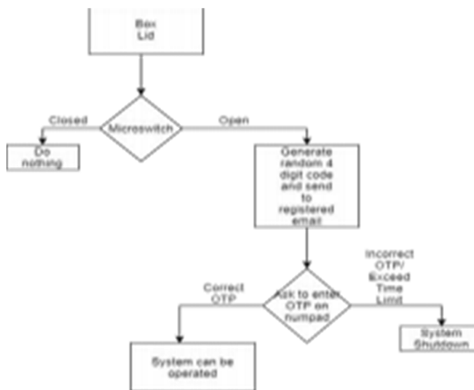
Fig 1. Flow Chart of Working Model

This set up initially relies on a microswitch to learn about the status of the box. The microswitch is connected to the Raspberry Pi which regularly reads the state of the switch. The switch being in a closed state indicates that the box is closed while the switch in open state indicates that the box is open. Once the Raspberry Pi learns that the box is open, a random four-digit number is generated and sent to a registered email address. As soon as the code is sent, a timer for one minute begins. The code can be entered using the 4x4 keypad. Once ‘A’ is pressed on the keypad, the values entered prior to this action are read and compared to the random digit that is generated. If the code entered is correct, the system exits this process and allows the user to use the system as normal. But, if the entered code is incorrect or the timer expires before the code can be entered, the system will lock out the user by force shutting down.