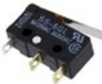
Fig 3. Microswitch

A Micro Switch is a small, very sensitive switch which requires minimum compression to activate. They are very common in-home appliances and switch panels with small buttons. Micro Switches have an actuator which, when depressed, lifts a lever to move the contacts into the required position. Microswitches often make a “clicking” sound when pressed this informs the user of the actuation.